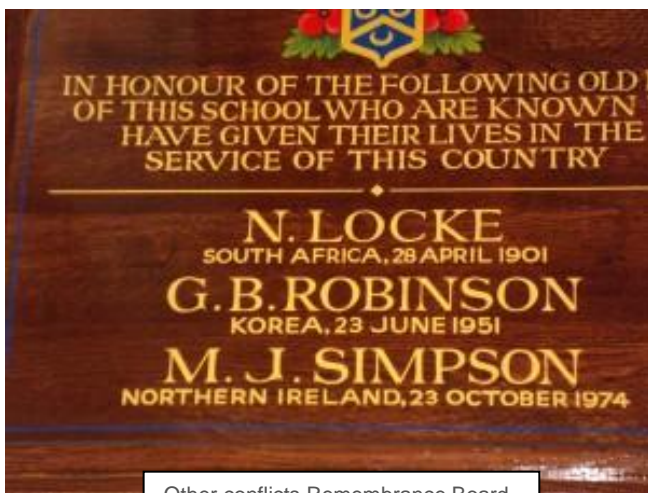
Other conflicts Remembrance Board