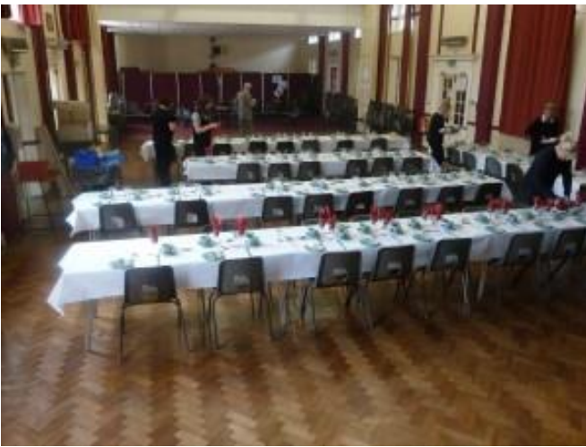
Before the event