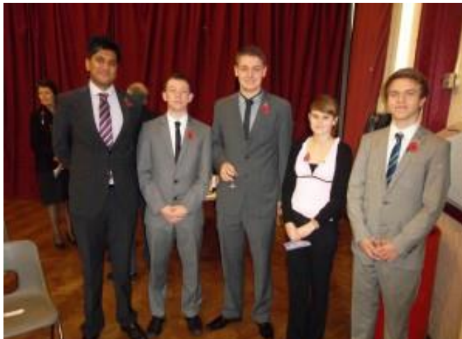
Representatives of the school at the re-dedication service