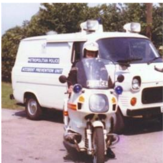
With my BMW and the APU van in Dulwich

I had been at Woolwich about a year when I had a recurrence of a cartilage injury to my knee which required surgery and I spent the next two months on sick leave. I returned to duty and after about two weeks I had a call from the Chief Inspector in charge of the Accident Prevention Unit. He asked me if I would be interested in rejoining the unit in charge of one of teams. I replied that I would, but being a relatively new sergeant on Division was not sure how my Chief Superintendent would view it. Luckily he did agree to my transfer and once again I was back in Traffic Division.