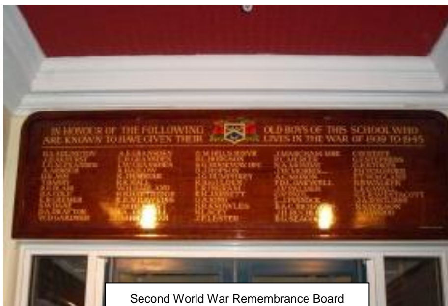
Second World War Remembrance Board