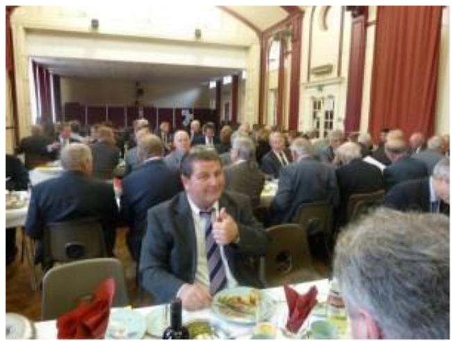
Happy with the dinner?